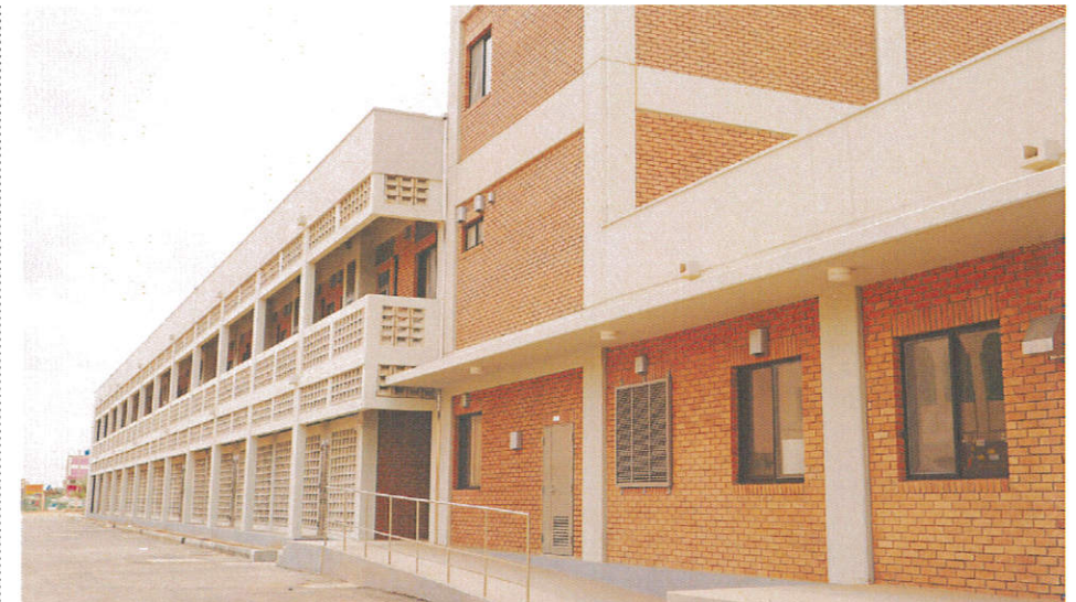
In November, the maternal ward building of Umbaddah Hospital in the state of Khartoum was completed as a form of official development assistance from Japan.

This is an edited excerpt of information from the Japan International Cooperation Agency and other sources.